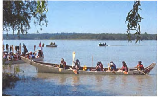
Aboriginal Youth Canoe Club – Pulling Together Journey