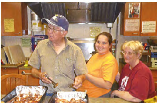
Amlat'si / Family Branching Out