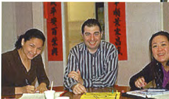
ELSA-English Language Services For Adults