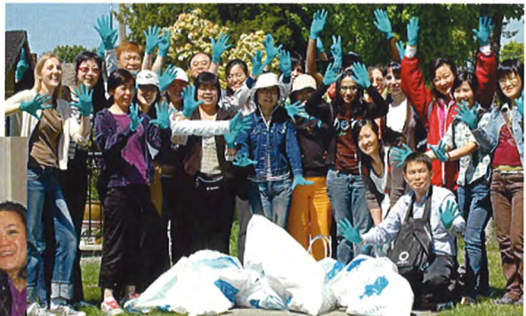
Keep Vancouver Spectacular Cleanup-ELSA Students