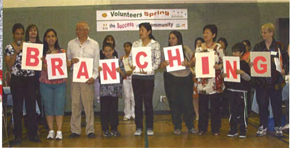
Volunteer Recognition Party