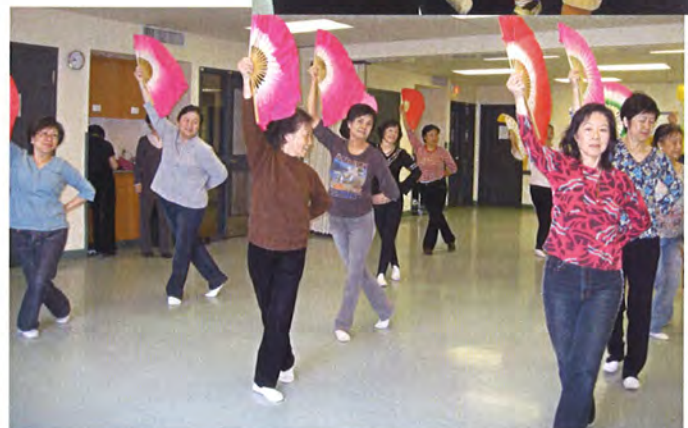
Chinese Classical Dance