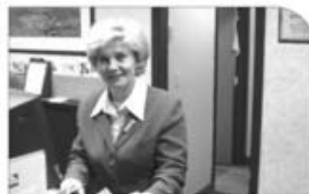
Vera De-Gernier Ramada Hotel & Suites

Suite 300 3665 Kingsway Vancouver, BC V5R 5W2 www.shopcollingwood.ca T 604 639.4403 F 604 435.8181 E coordinator@shopcollingwood.ca