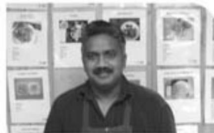
Vishy Simply Curries Inc.