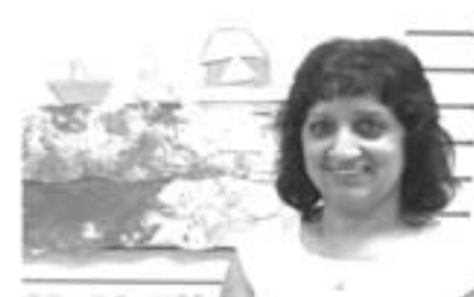
Jas Mahal Tiny Bubbles Preschool